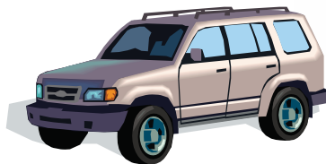
or in the car.

How will you find each other? How will you know if your family is safe?